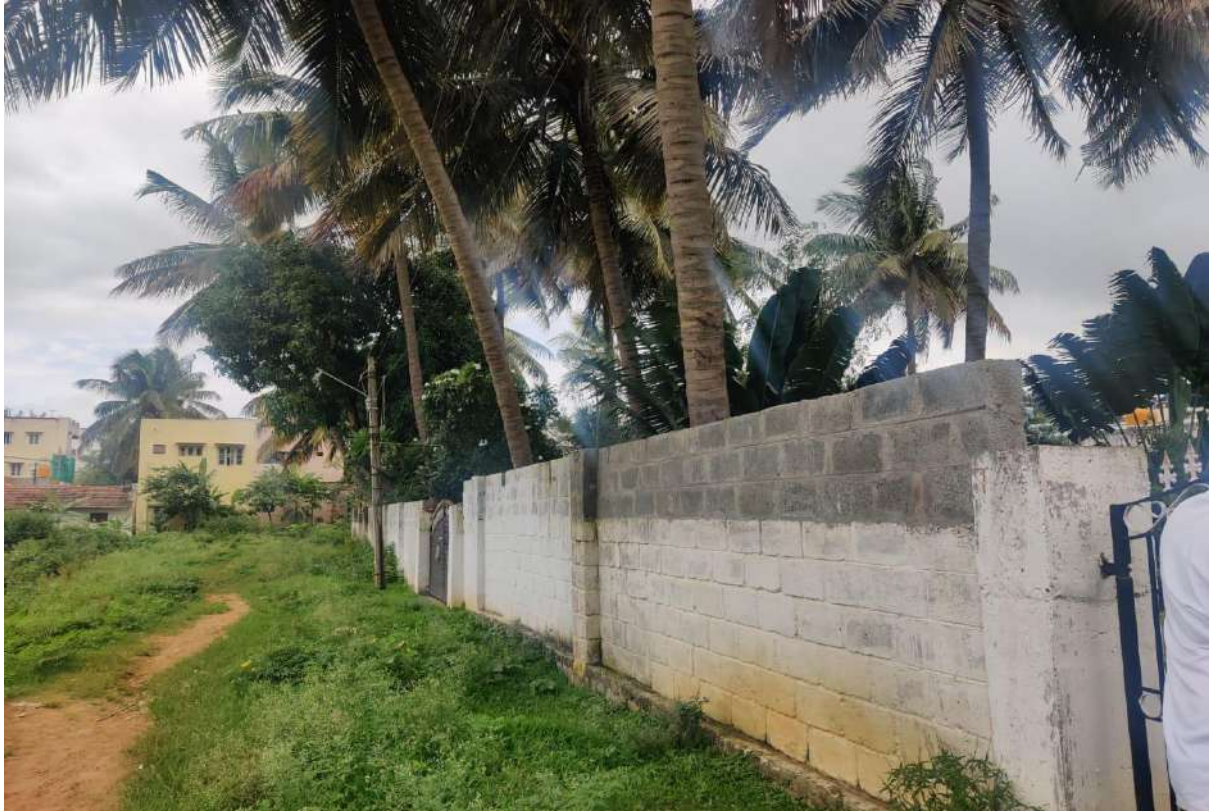
WAY TO DEEPASHRI REHAB CENTER