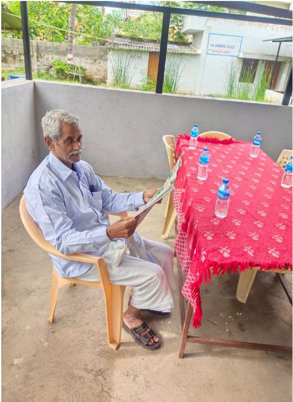
DINING HALL AREA