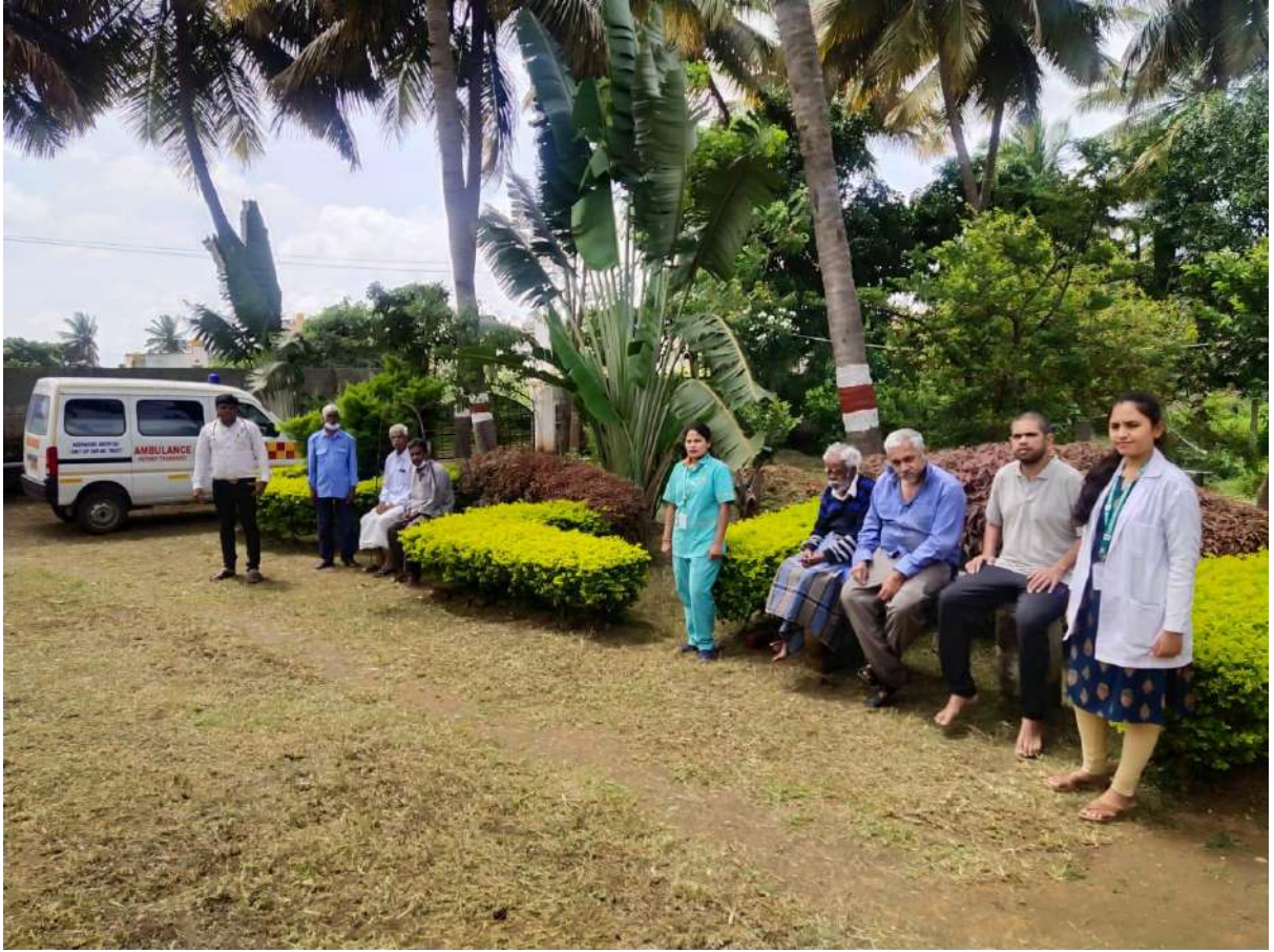
STAFFS WITH THE INMATES