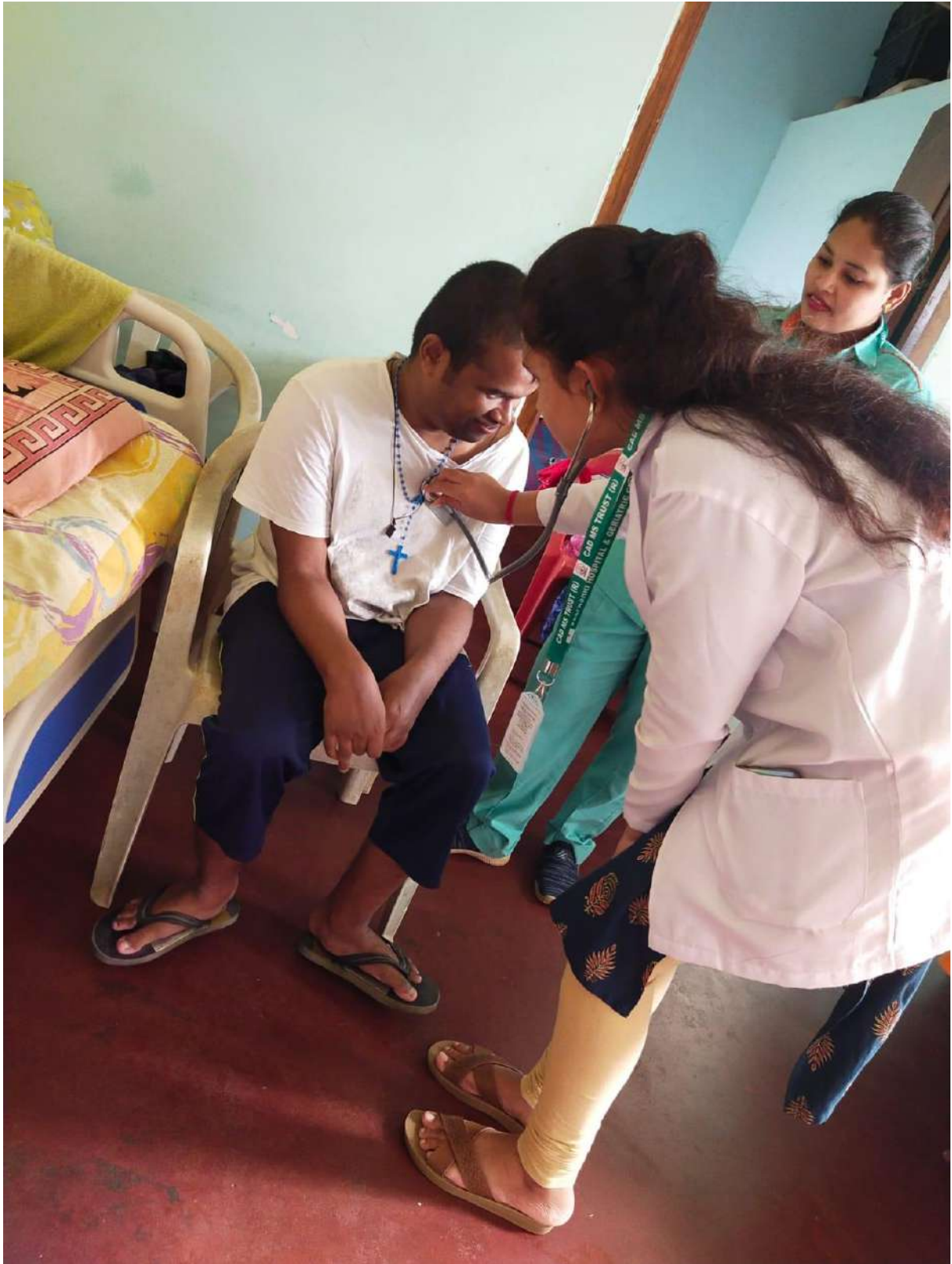
MEDICAL CARE FROM THE PROFESSIONAL DOCTORS & NURSES