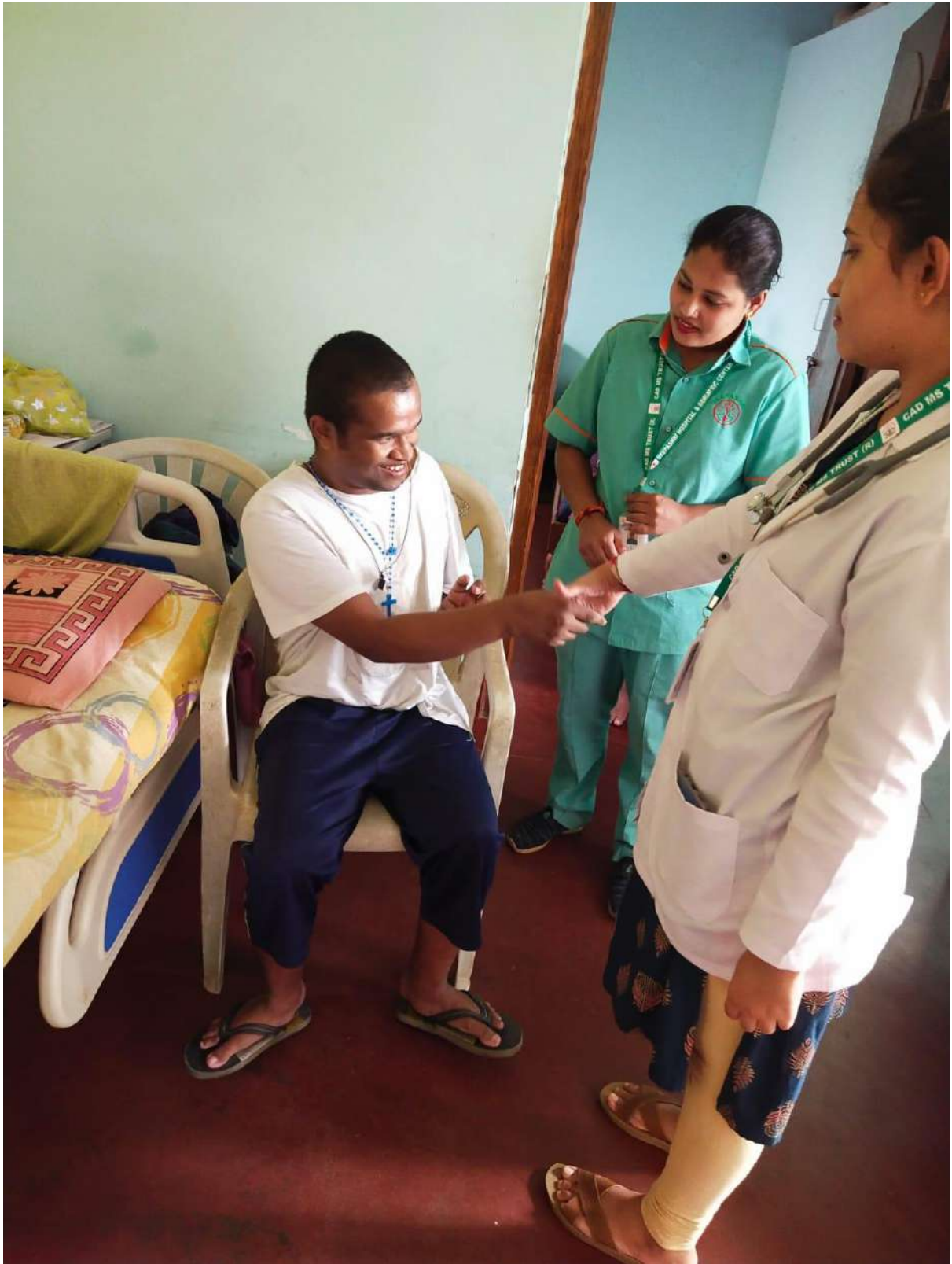
INMATE WITH THE STAFFS